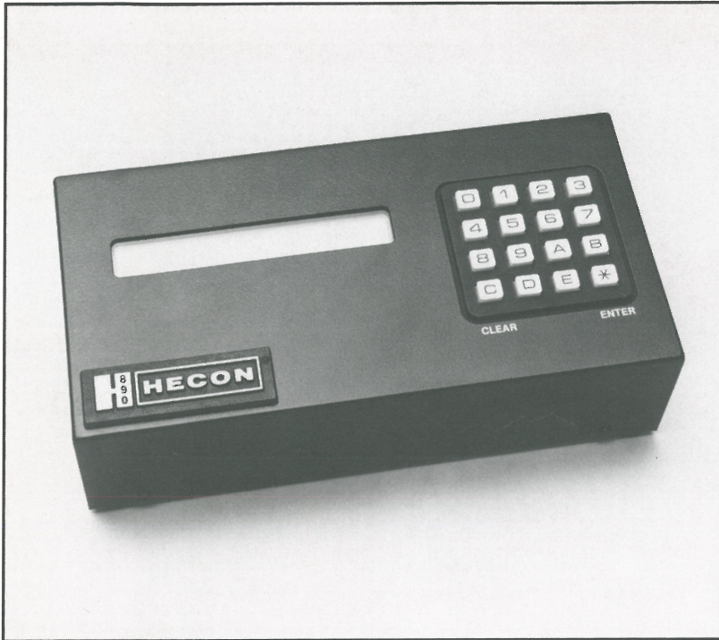
The Keypad Controller for Facsimiles