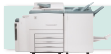
shown with High-Capacity Feeder and optional Professional Finisher (100-sheet stapling, saddle-stitch booklet making and tri-folding)