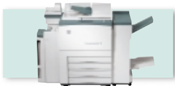
shown with High-Capacity Feeder, optional Finisher (50-sheet stapling) and Convenience Stapler

For more information, call 1-800-ASK-XEROX or visit us at www.xerox.com . For detailed product specifications, contact your Xerox representative and ask for the Document Centre 490 Specification Document.