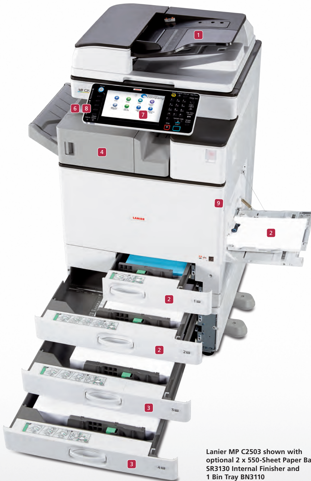
Lanier MP C2503 shown with optional 2 x 550-Sheet Paper Bank, SR3130 Internal Finisher and 1 Bin Tray BN3110