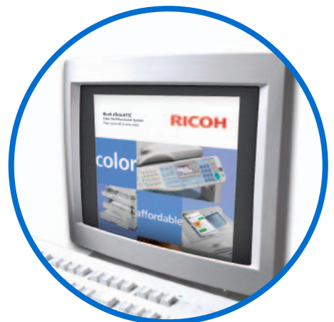
Scan and distribute full-color documents to hundreds of e-mail addresses at virtually no cost.