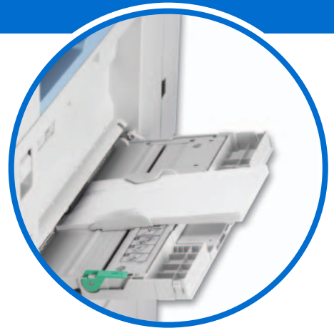
The Ricoh Aficio 615C makes it easy to print on envelopes.