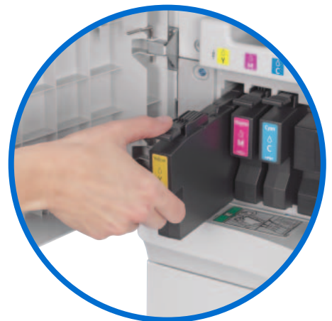
Unlike other inkjet systems, the Ricoh Aficio 615C's single-color ink cartridges let you replace only the color that is empty for reduced ink waste and cost.